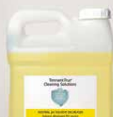
NEUTRAL pH SOLVENT DEGREASER