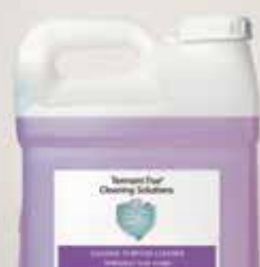
GENERAL PURPOSE CLEANER