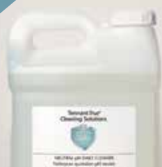
NEUTRAL pH DAILY CLEANER