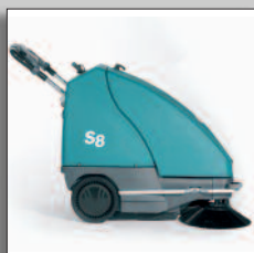
Strong roto-moulded covers