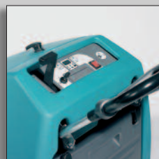
Easy to operate