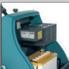
Standard on board charger