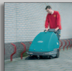
Machine in action