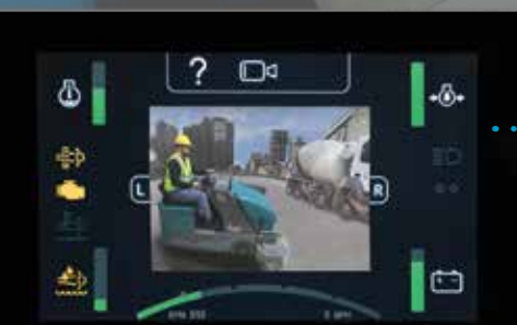
PERFORMANCEVIEW™ CAMERA SYSTEM