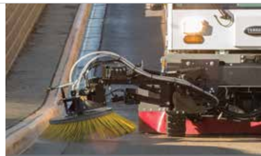
OPTIONAL VARIO SWEEPING BRUSH™

Optional Vario Sweeping Brush™ allows the Sentinel the ability to sweep on top of curbs, collect hard to reach debris from corners, around fixed obstacles and in congested areas for increased productivity and more effective sweeping.