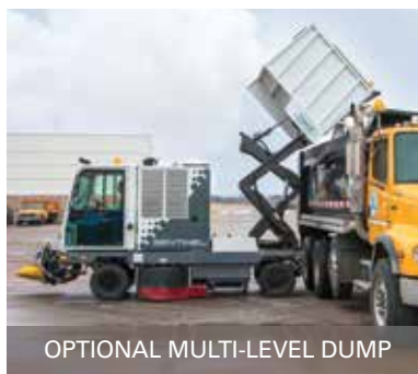
OPTIONAL MULTI-LEVEL DUMP

Optional Vario Sweeping Brush™ allows the Sentinel to collect debris from corners while keeping the sweeper from riding up on curbs; giving the operator the ability to sweep on top of curbs and around fixed obstacles for increased productivity and more effective sweeping.