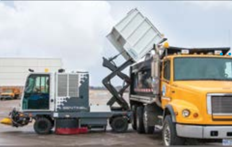
OPTIONAL MULTI-LEVEL DUMP