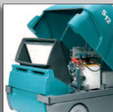
Easy filter change