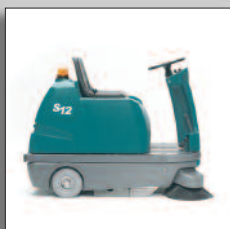
Standard side brush