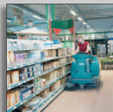
Machine in action