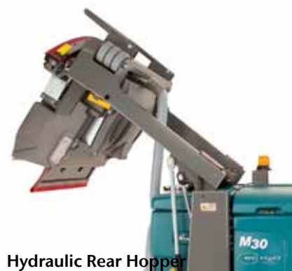
Hydraulic Rear Hopper