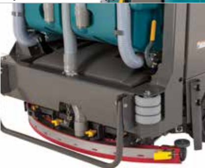
Dura-Track™ Parabolic Squeegee

Overhead guard protects operators from falling objects.