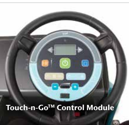
Touch-n-Go™ Control Module

▶ Touch-n-Go™ control module with 1-Step™ start button allows operators quick access to all settings without removing hands from the steering wheel.