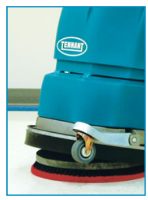
The Speedlock™ feature on the 5100 makes changing brushes or pad drivers as easy as touching a button.

Whether your facility has small, congested areas or wide open aisles, look to Tennant to meet all of your cleaning challenges.