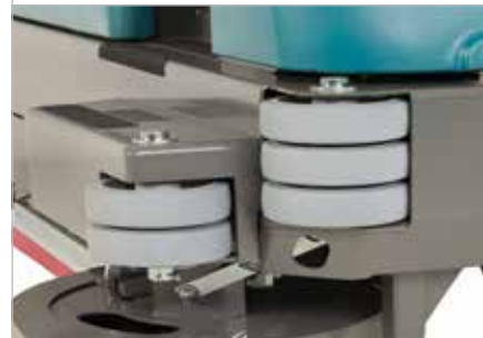
Heavy-duty Frame and Cushioned Corner Rollers

Overhead guard protects operators from falling objects.