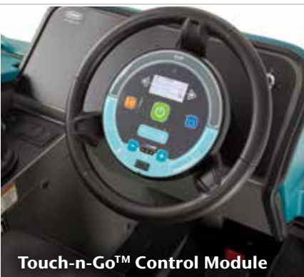
Touch-n-Go™ Control Module