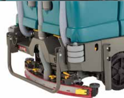
Dura-Track™ Parabolic Squeegee