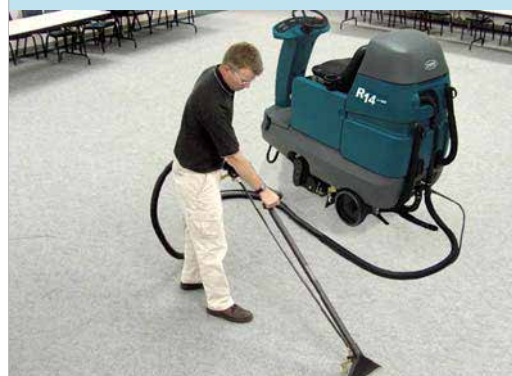
Low Pressure 330mm Wand Extension (optional)