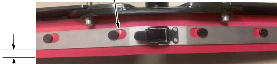
Squeegee blade retainer straps installed incorrectly (upside down)

Note: The slots in the strap are vertically off-centered. If the straps are installed upside down, the strap moves closer to the floor as shown below, restricting proper blade deflection.