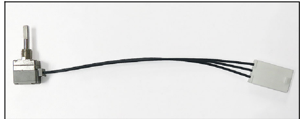
New Potentiometer (p/n 1246392)

Original potentiometer (p/n 1204930) has been discontinued.