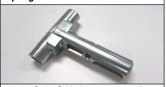
1235860 Spring Guide (no spacer required) 9016897 Installation Instructions