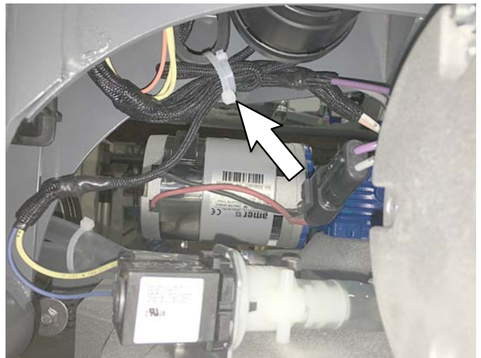
To prevent wire harness from coming in contact with the solution valve, secure the wire harness to the machine frame grommet with a cable-tie as shown.