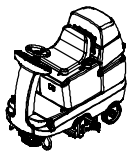
R14, Strive Rider