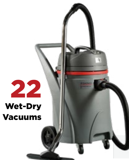
22 Wet-Dry Vacuums