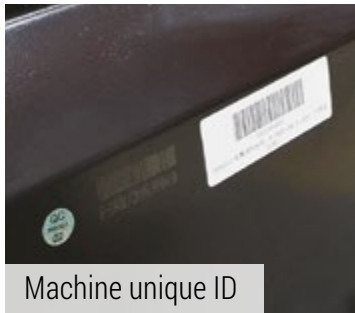
Machine unique ID