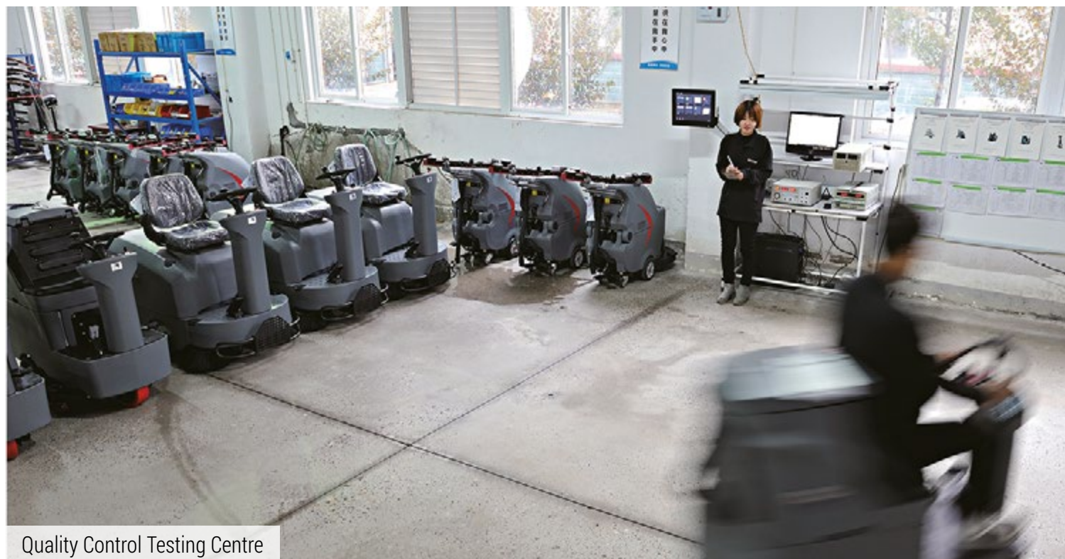
Quality Control Testing Centre