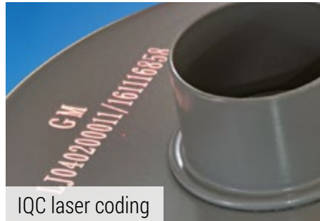
IQC laser coding