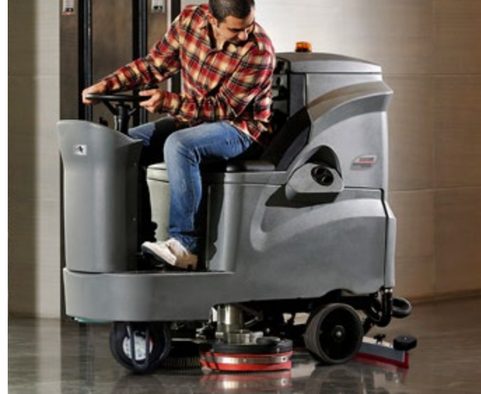
12 Scrubbers - Ride On