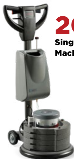
20 Single Disc Machines

Explore a range of equipment for both your soft and hard floor cleaning needs.