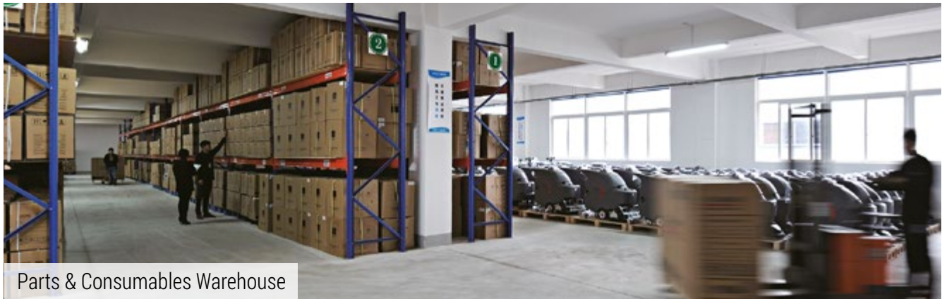
Parts & Consumables Warehouse