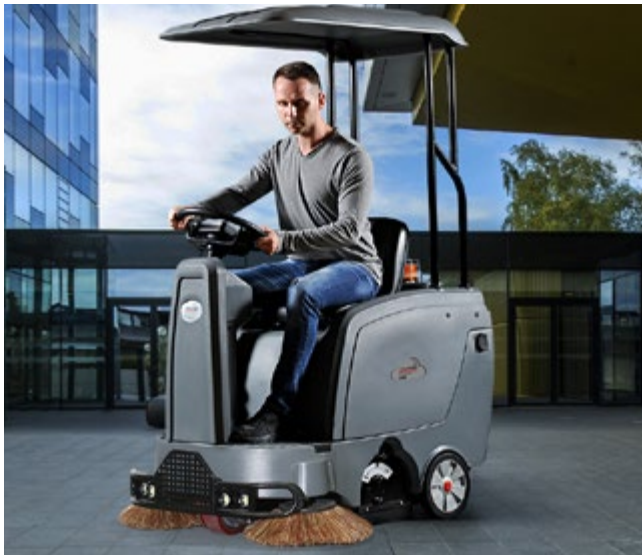
16 Combination Sweeper-Scrubbers