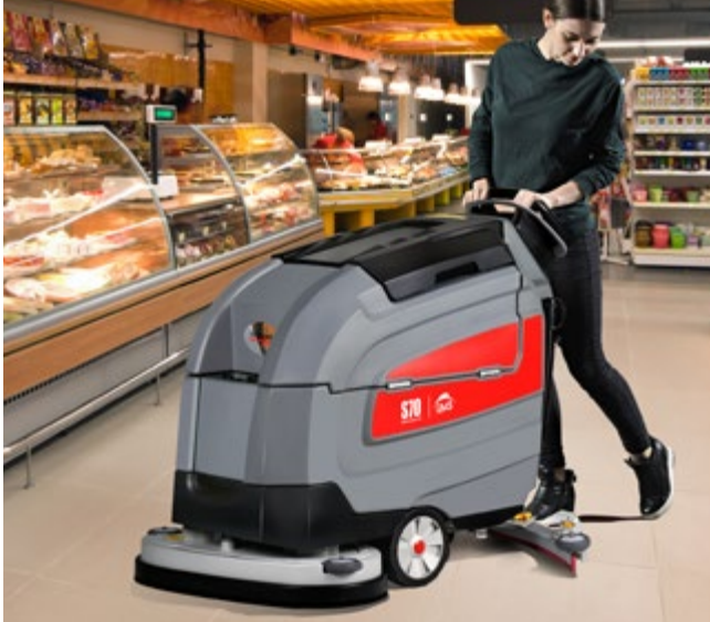
8 Scrubbers - Walk Behind

Discover GAOMEI floor cleaning equipment for your every place and space