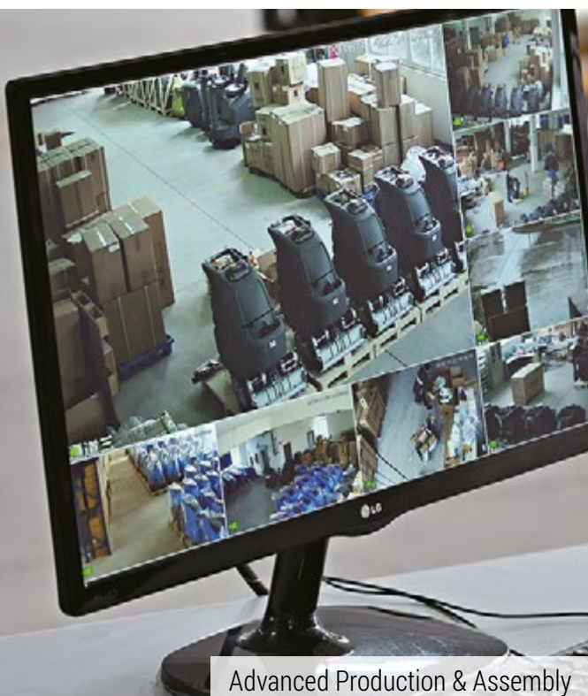
Advanced Production & Assembly

Vertically integrated, GAOMEI produces up to 80% of equipment components in-house including sheet metal processing, rotational molding production, wire harnessing etc.