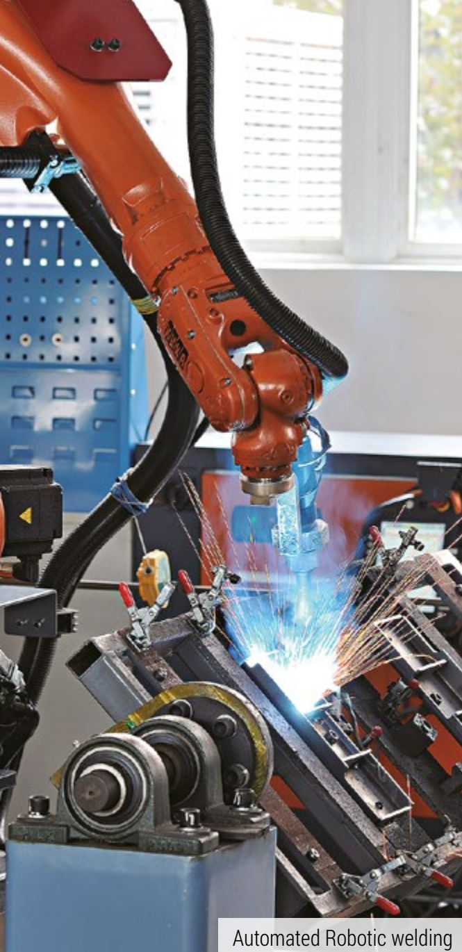
Automated Robotic welding