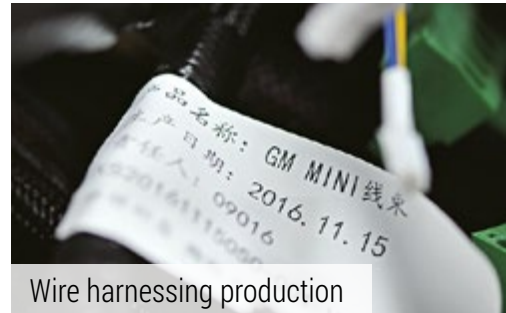
Wire harnessing production