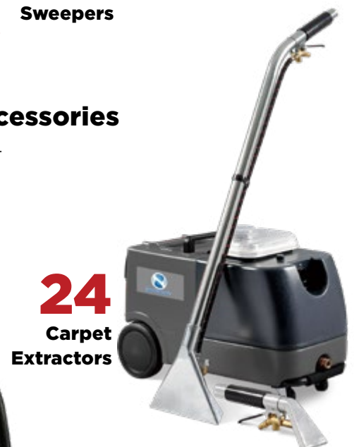
24 Carpet Extractors